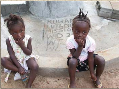
Twins in the Kuwaa village of Gbiyankei are sitting by a well that the Kuwaa Mission gave to their town in 2010.