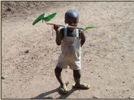
This boy in Sasasu made a helicopter out of palm fronds, after the Samaritan's Purse helicopter delivered supplies to dig a well in his village in 2011. He suffers from polio, due to lack of vaccines.